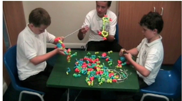
Figure 1. An example of Autistic children playing together with Topobo in a collaborative setting

Copyright 2009 ACM 978-1-60558-246-7/08/04...$5.00